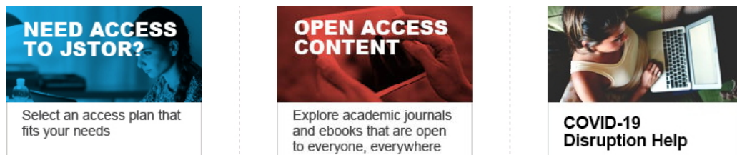
Figure 2: Example of a general extension of open access by JSTOR [viewed 28 May 2020 at https://p.j-img.org ]

Figure 2 gives an example of granting a wider extension of open access, with particular reference to researchers in all fields of study, who may seek support "during this challenging time in which many are unable to get to physical libraries, we have expanded our free read-online access to 100 articles per month through June 30, 2020." [5]