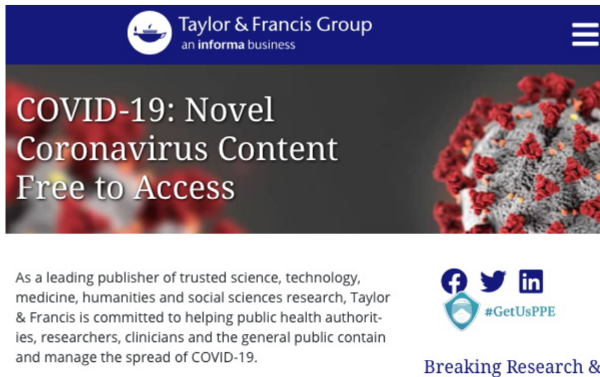
Figure 1: Example of open access offered to Covid-19 researchers by Taylor & Francis [viewed 28 May 2020 at https://taylorandfrancis.com/coronavirus/ ]

This is a brief reflection upon pandemic-induced changes in academic publishing as an industry. The difficult, perhaps even unhappy topic of IIER's "spike" in submissions per month has been mentioned above, but pandemic-induced actions in academic publishing is a more relaxing topic (IIER workloads are not affected by their actions!). Below, a few illustrative quotations are given from the websites of some of the world's largest academic book and journal publishers, to illustrate quite interesting features. Figure 1 provides an example of open access and special indexing being granted for content of importance to coronavirus researchers.