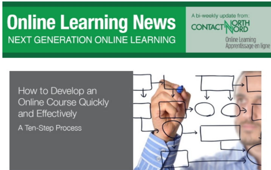
Figure 5: Contact North (2020). How to develop an online course quickly and effectively. Online Learning News , 22 April. http://send.successbyemail.com/prvw_message2.aspx?chno=050f9fe2-759b-4672-8a07-aad25f0c0975

However, there is an abundance of online teaching and learning that are permanently open access, for example from Canada's Contact North [https://teachonline.ca] illustrated in Figure 5.