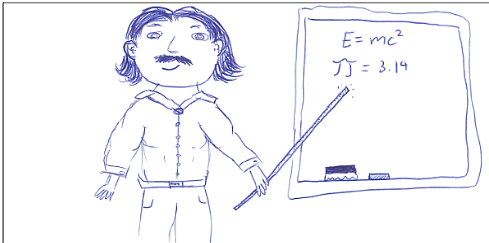
Figure 2: The teacher in a traditional, teacher-centred classroom setting (male Primary PST). Caption: "Wearing a button-up [shirt] to look professional"

setting. The presence of clipboards and shovel suggests a more active learning setting where students are more actively involved in the learning.