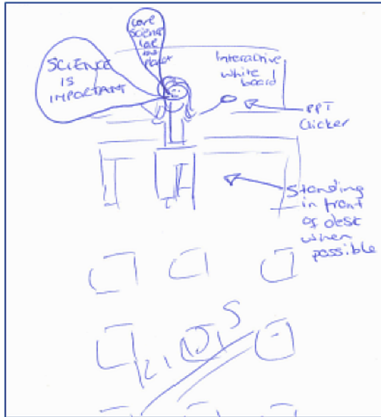
Figure 4: Representation of a science classroom with desks and chairs (female Secondary PST).

Figure 4 illustrates an example of a pre-service teacher who envisages herself in a traditional classroom setting, in particular, a science classroom, as indicated by the teacher's raised demonstration bench. Despite the traditional setting, the student notes that she will stand "in front of the desk when possible". She also includes an interactive whiteboard, but this is separated from the learning space by the desk.