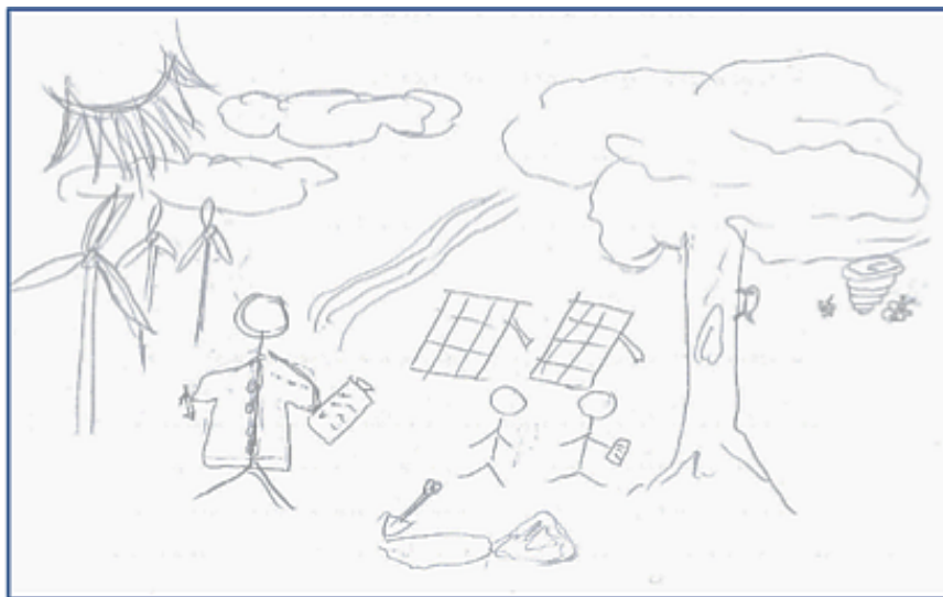
Figure 3: The teacher engaging with students in an outdoor setting (male Secondary PST). Caption: "Giving students a passion for science by engaging them in real applications of science"