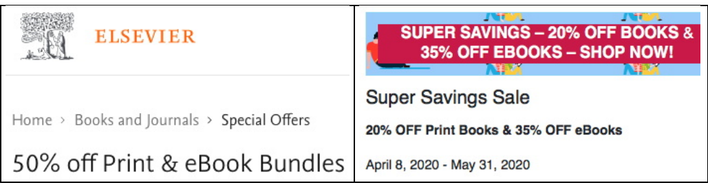
Figure 3a: Elsevier book sale [viewed 28 May 2020, https://www.elsevier.com/books-and-journals/special-offers]

Figure 3 illustrates another kind of pandemic-induced action, indicating that academic publishing has lost sales volume, presumably due mainly to campus closures and suspensions of classes in universities and colleges.