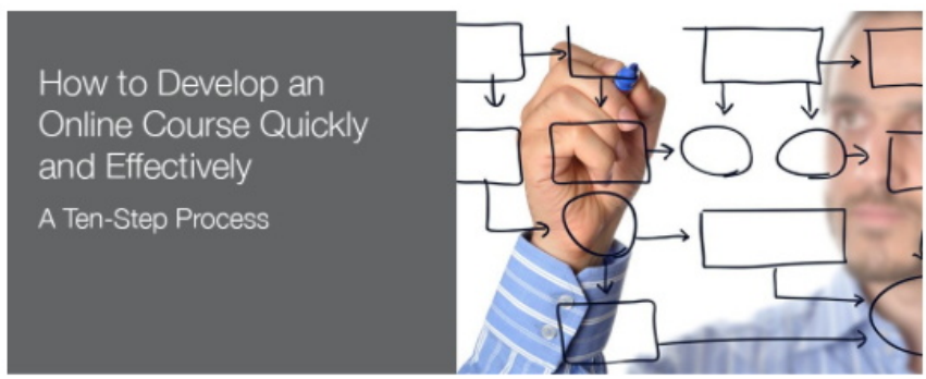
Figure 5: Contact North (2020). How to develop an online course quickly and effectively. Online Learning News , 22 April. http://send.successbyemail.com/prvw_message2.aspx?chno=050f9fe2-759b-4672-8a07-aad25f0c0975

Figures 1-5 provide only a small sample of the valuable range of unprecedented actions by the academic publishing industry. An interesting sample, but perhaps the most interesting aspect will be post-pandemic. Has the world's appetite for open access and low cost, electronic only delivery been stimulated so much during the pandemic, that it will become very difficult to "snap back" completely, post-pandemic, to the pre-pandemic business models used by the major publishers?