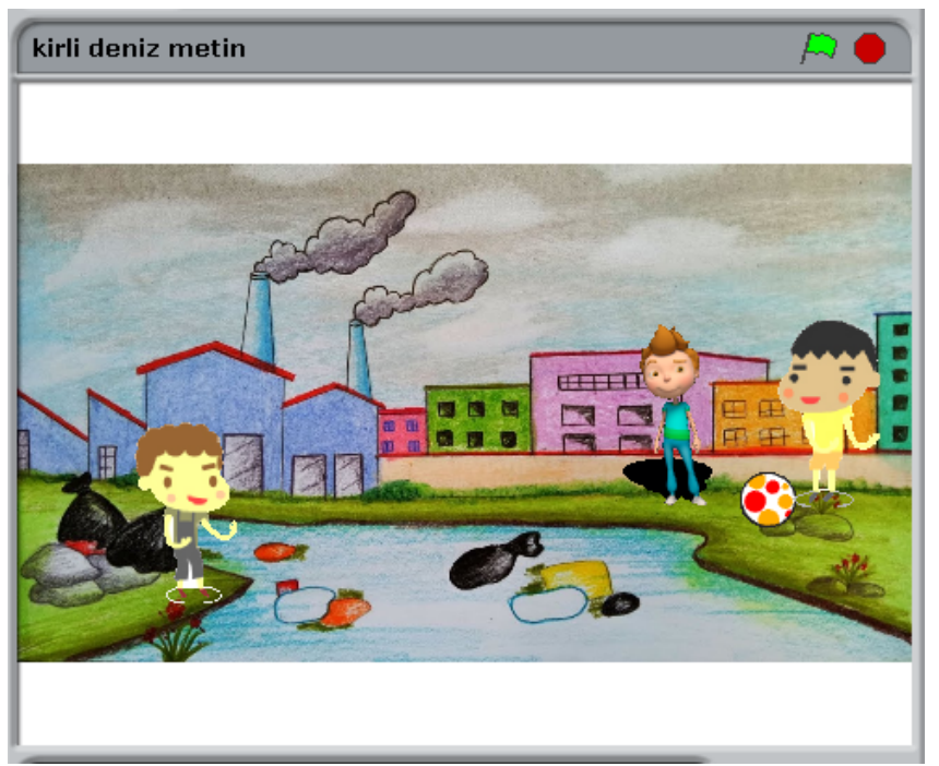
Figure 2a: Sample screen shots of during-listening activities