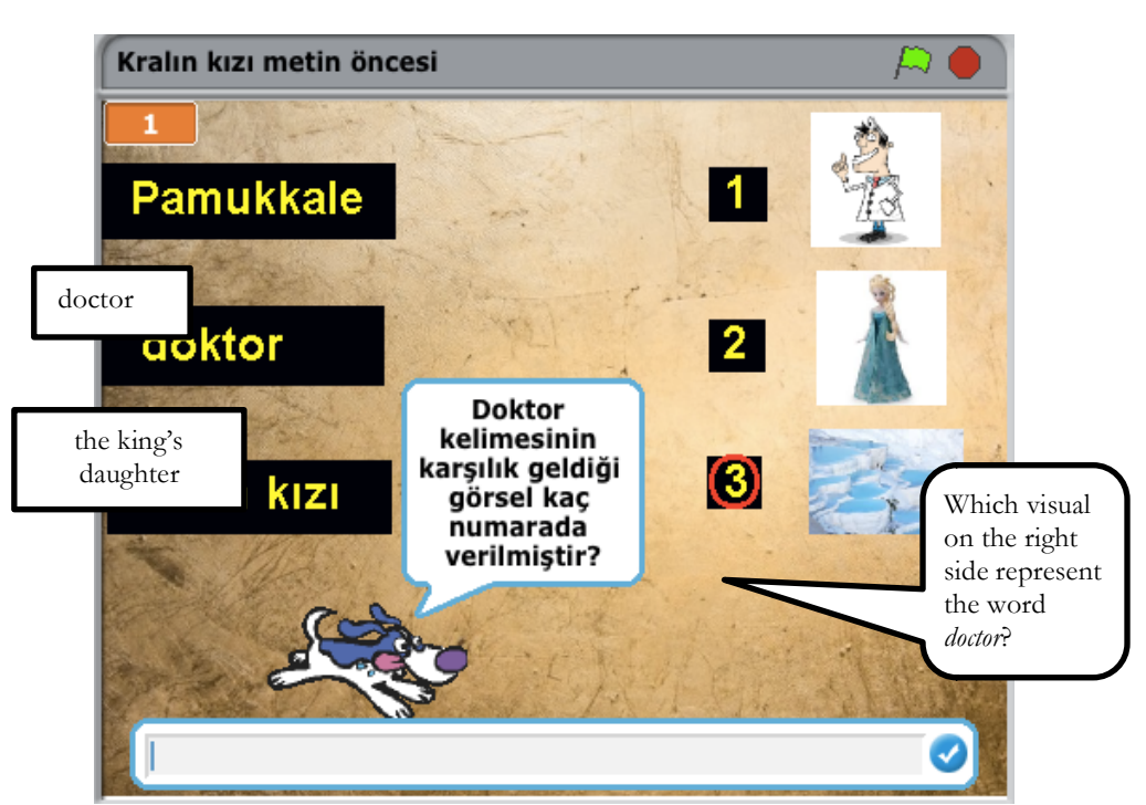
Figure 1b: Sample screen shots of before-listening activities