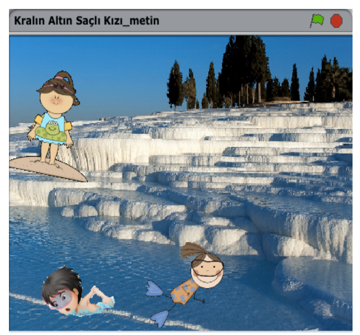
Figure 2b: Sample screen shots of during-listening activities

Students listened to the texts in the during-listening activities, while looking at the text related pictures. The during-listening activities included multimedia features (i.e., visuals and spoken text). The visuals in these samples included static (e.g. the background images) and animated objects (e.g. the kids, the ball, and the swimmers). Spoken texts were read aloud and recorded by the researchers.