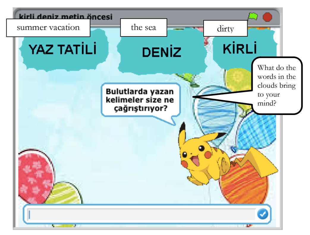
Figure 1a: Sample screen shots of before-listening activities

The listening activities were created with Scratch programming. For this, before-listening activities, during-listening activities and after-listening activities were prepared (see Figure 1). We used static pictures and animated characters representing the listening texts, and voice recordings in which the texts were read aloud. By doing this, we aimed at presenting the listening texts through eyes and ears. The before and after listening activities consisted of text-related questions, an answer button to respond to the questions, and an animated character asking questions and providing feedback based on students' answers. These before and after listening activities also had question-related static and dynamic pictures. The students completed these activities on computers, individually, at their own pace, taking approximately 30-60 minutes. The materials required Scratch on each computer, but an Internet connection was not required.