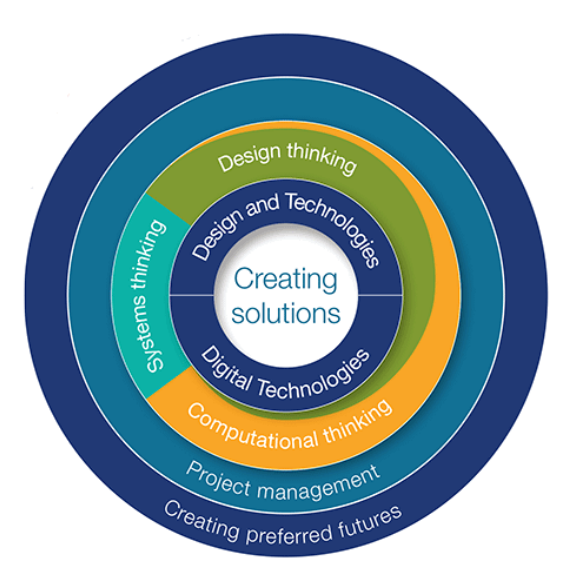
Figure 1: Project management role in the Australian Technologies curriculum From ACARA (n.d.), Figure 1.

However, unlike mathematics, science, and technology, it is unclear if the level of knowledge required to provide explicit teaching in such a technical domain as project management is present in Australian primary schools. For direct instructional techniques to be effective, domain-specific content must be chosen carefully to avoid misconceptions, and include concrete examples that are expertly selected and sequenced (Turner, 2019). The interdisciplinary nature of the topic provides an additional challenge since the exploration of problems and questions are not limited to a single discipline (NAS et al., 2005). Understanding the pedagogical delivery of domain-specific content in primary school requires dialogue with educators. Equally important is an understanding of the domain being explicitly taught, in this case project management, through the perspectives of industry practitioners.